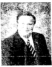
County Commissioner, District 2 Escambia County, Florida