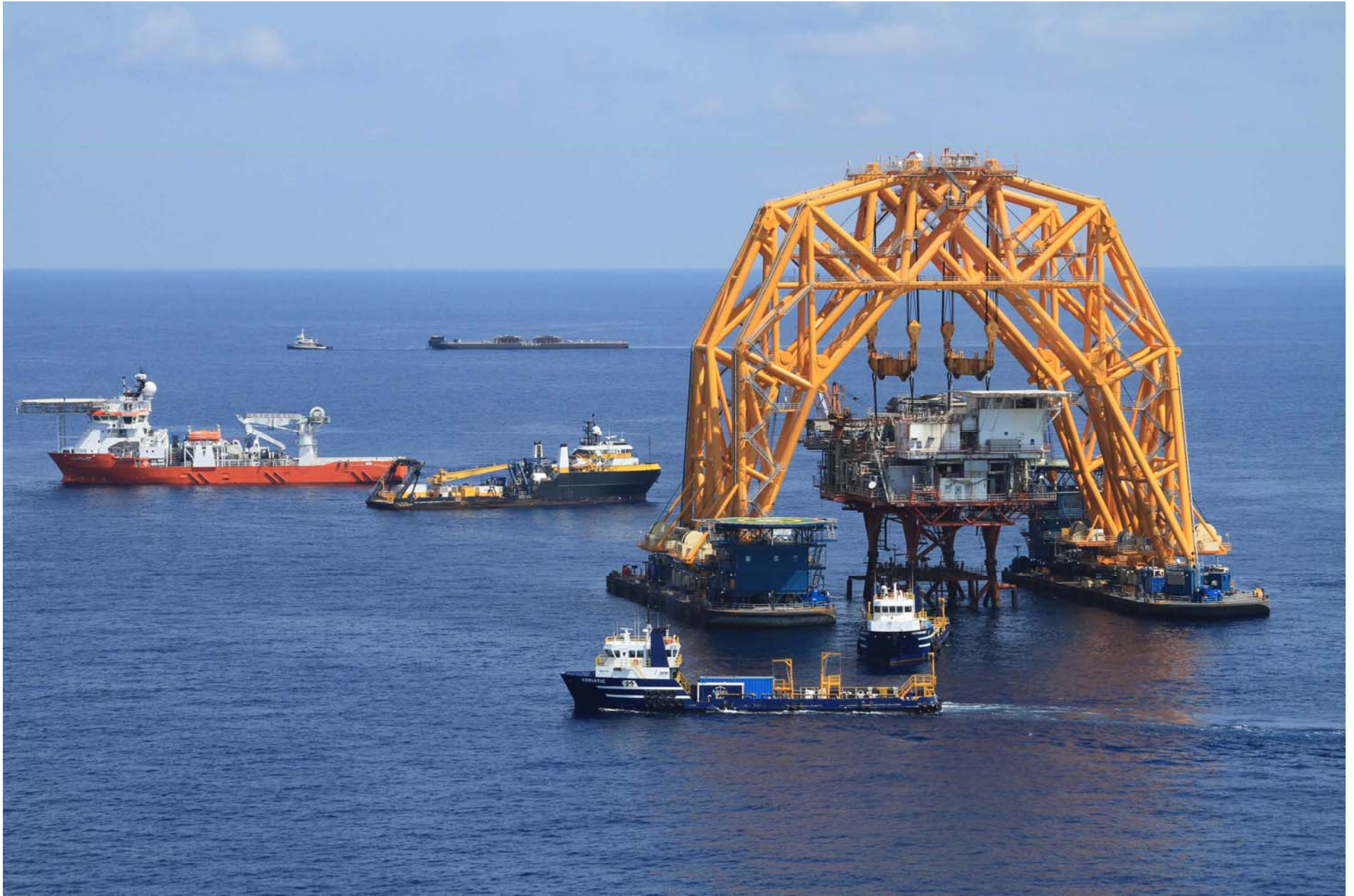
While the cuts are being completed, the transport barge (in the background) is towed into position nearby.