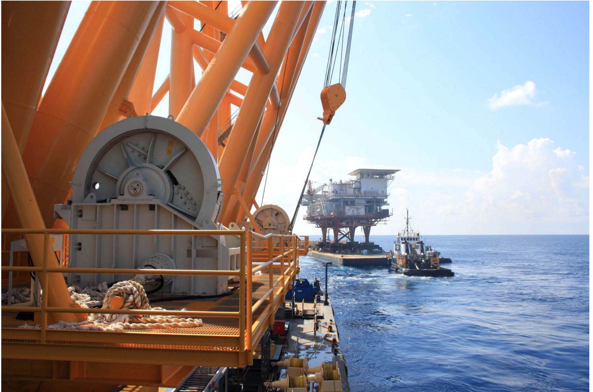
4:00 PM. The transport barge has cleared the VB-1000 and is ready for tow.