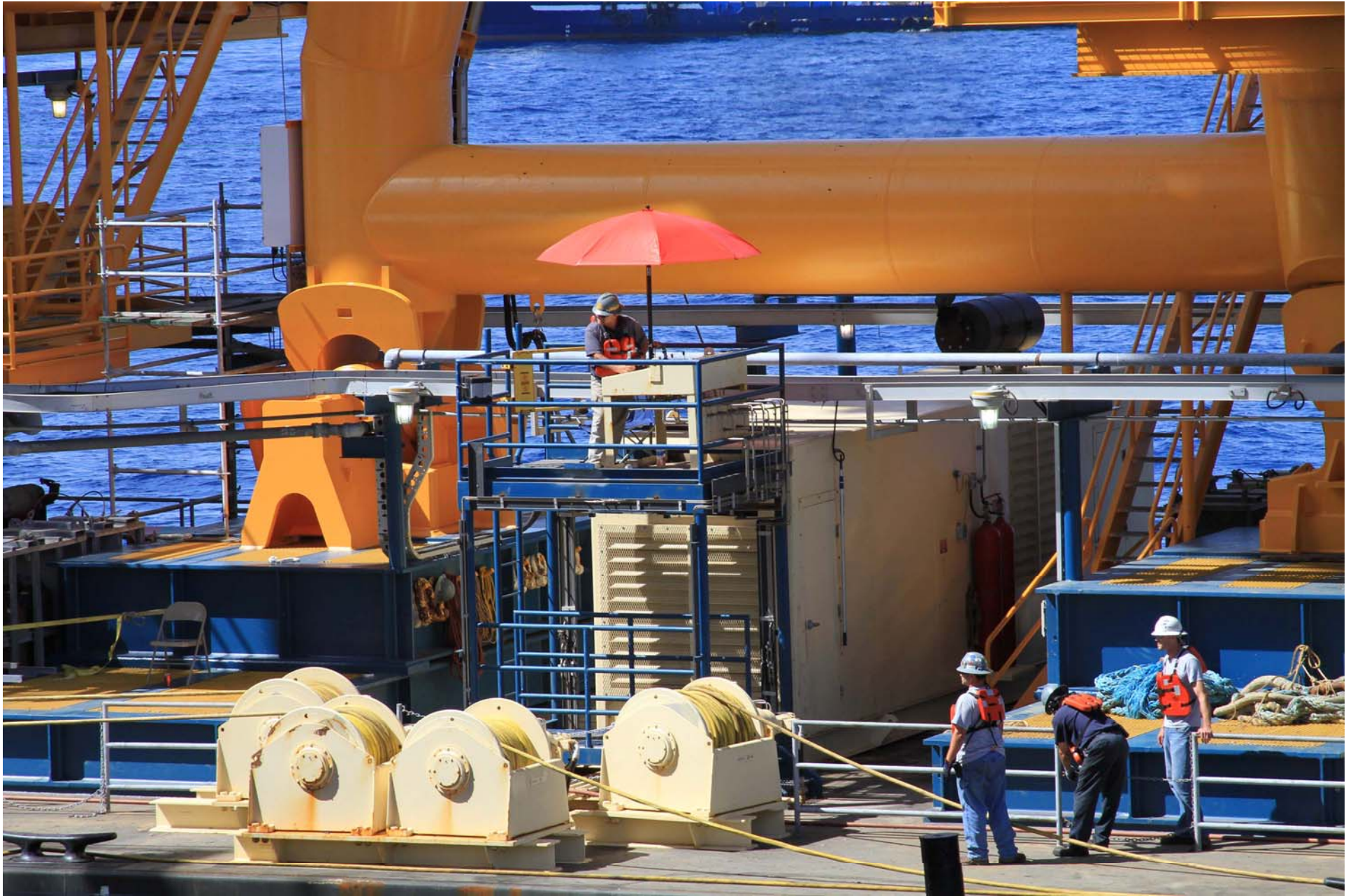
Again the VB – 10000 crew man the tugger winches to guide the transport barge out of its berth.