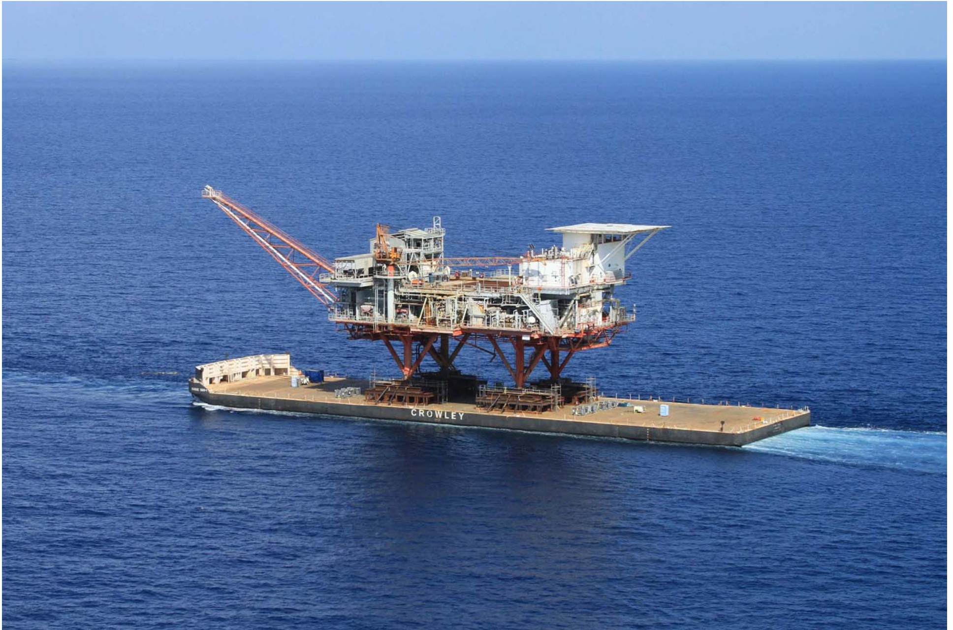
Flare boom and helideck intact. Now, that's a single-piece lift!