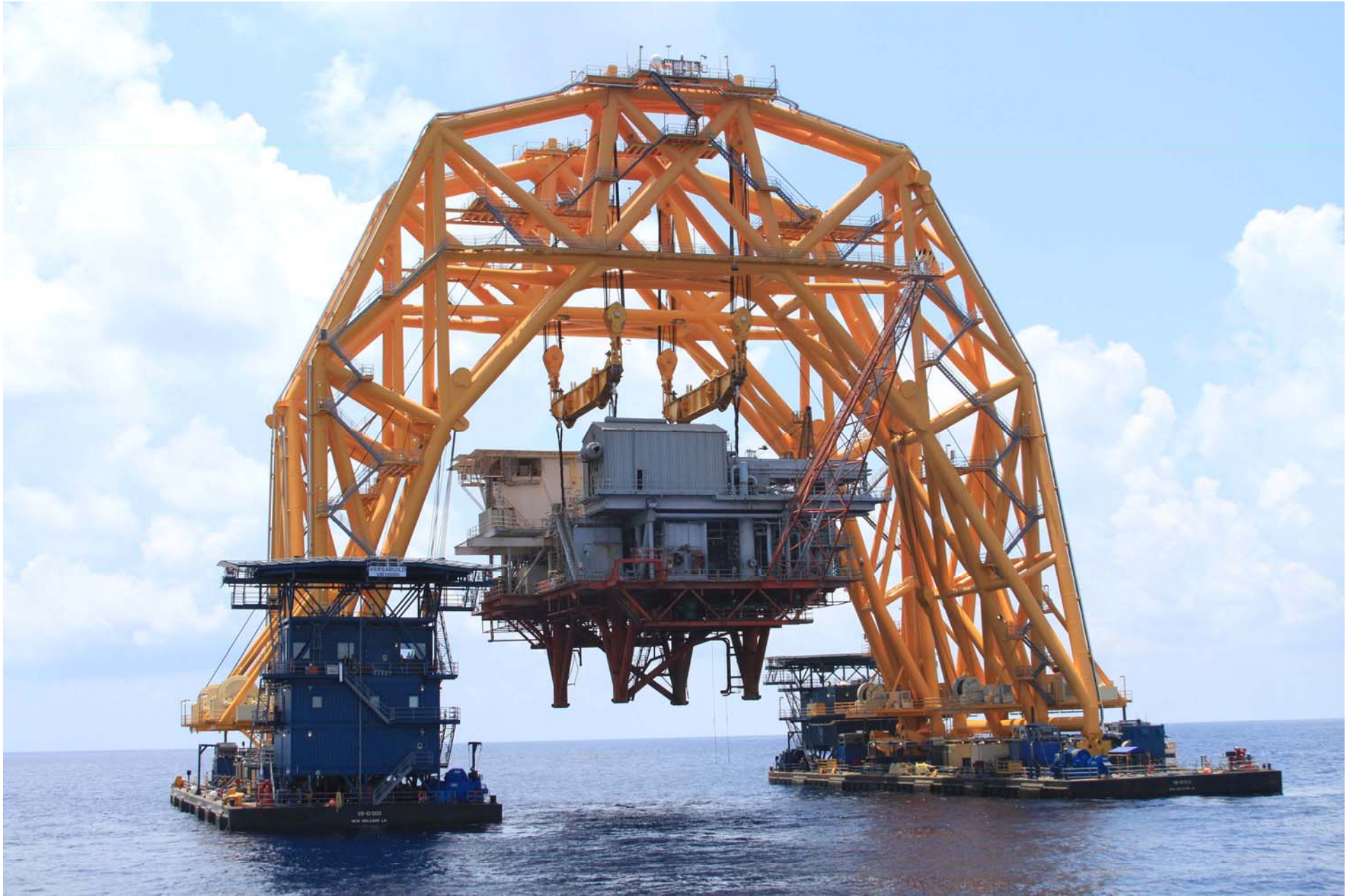
The VB – 10000's hook-height insures plenty of clearance for the barge.