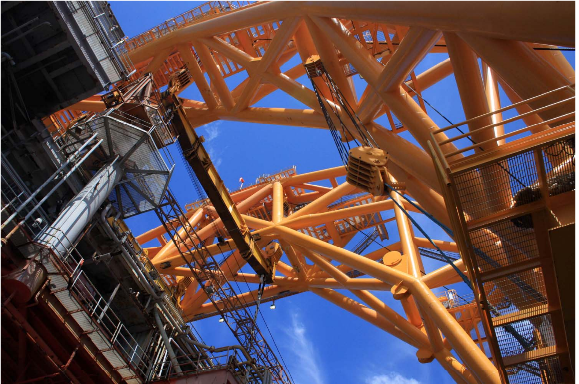
3:15 PM. The slings are unhooked from the topside. This view from the deck of the VB 10000 shows ample clearance, even for the large topside.