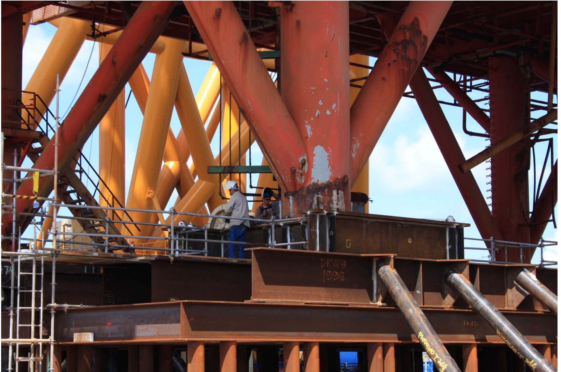
Welders immediately board the barge and begin the work of sea-fastening the topside.