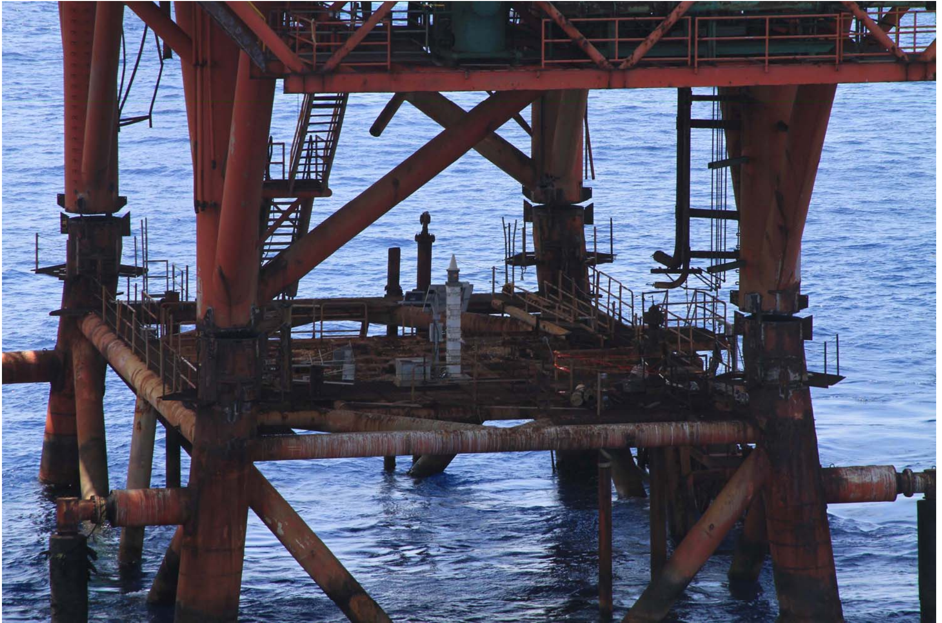
At 11:25, the topside comes out of the cans.