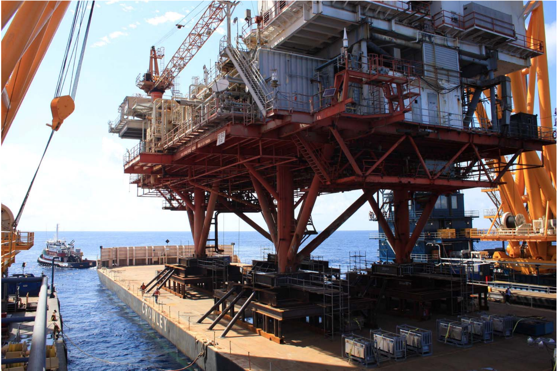
Smoothly the barge begins to slip out.