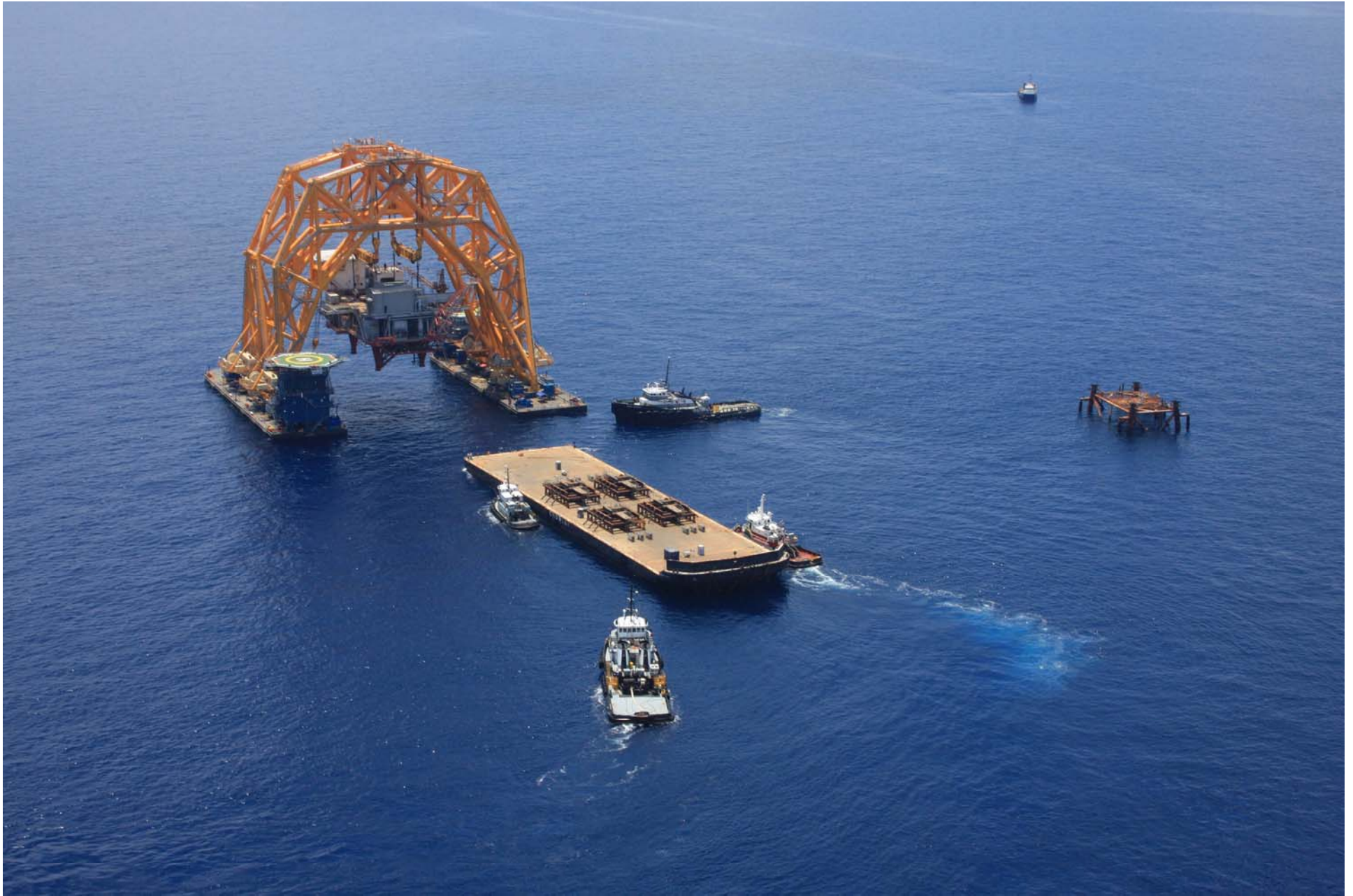
A calm sea state facilitates this delicate phase of the operation.