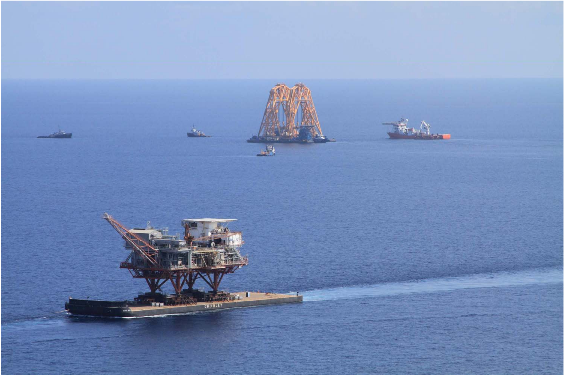
4:30 PM. The topside is under tow to a Gulf Coast salvage facility.