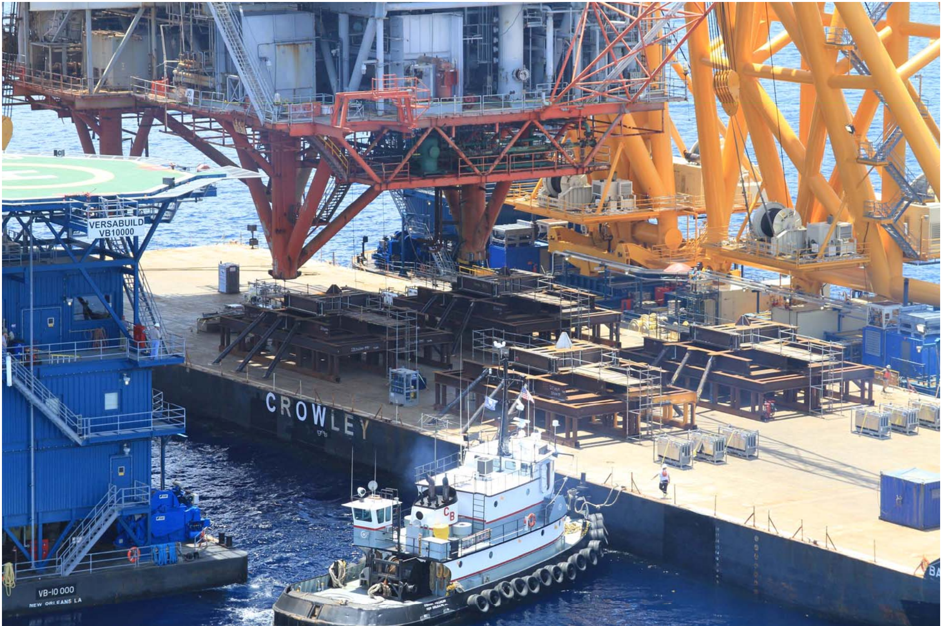
Using tugs and tugger winches, the barge is positioned to receive the topside.