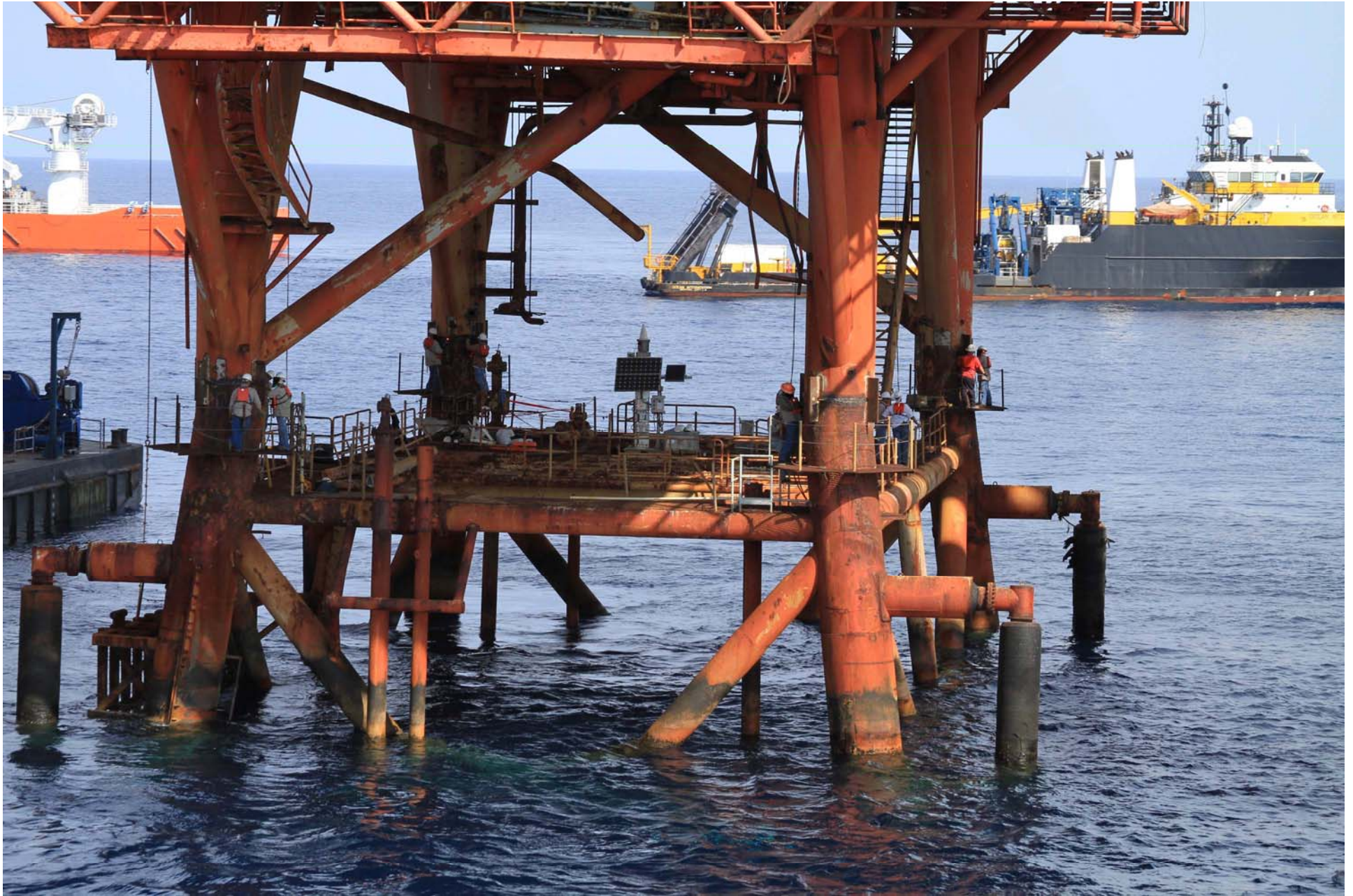
By 10:00, the welders are at work making their final cuts on the legs.