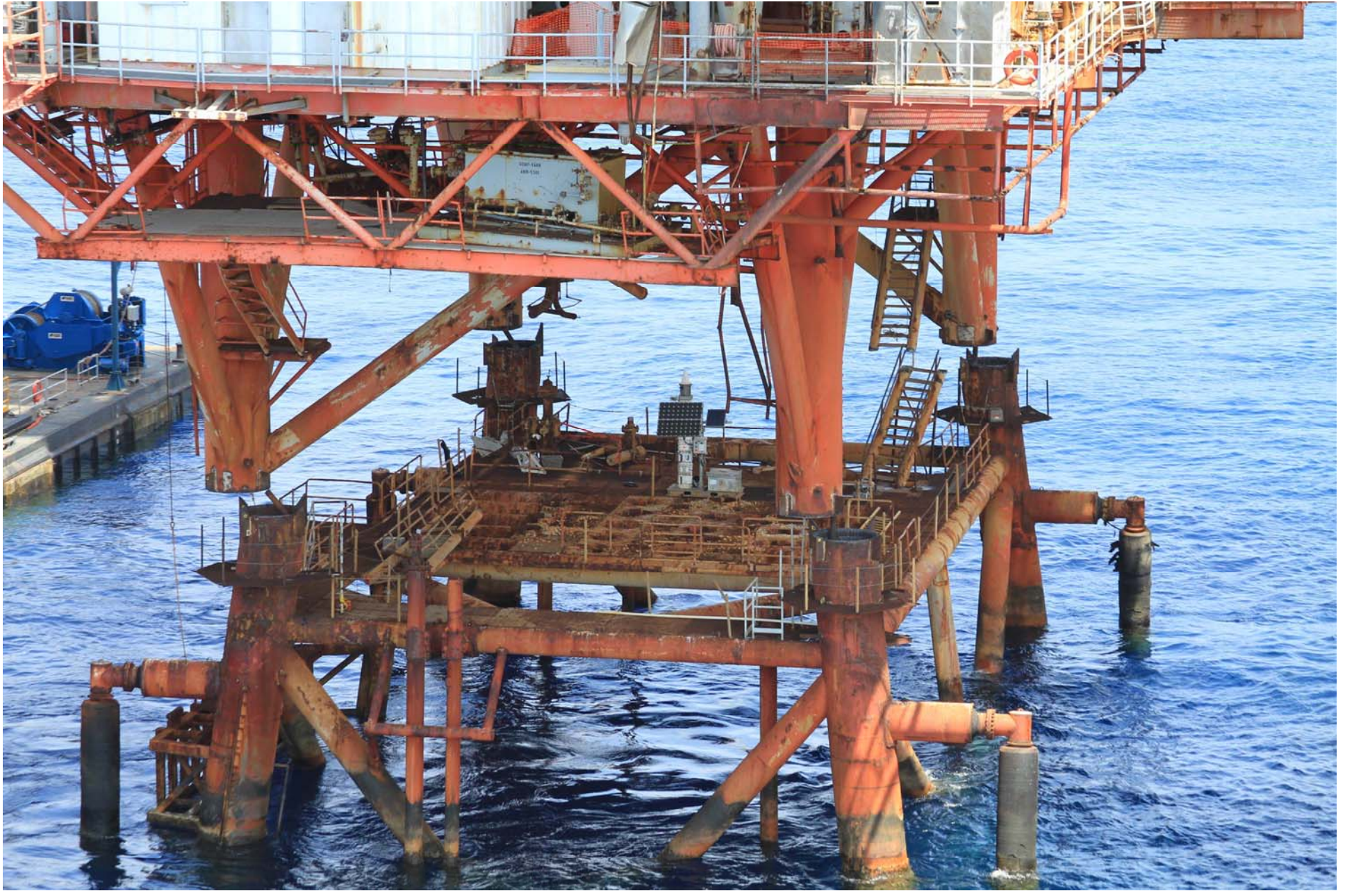
As soon as the topside is free of the jacket, the VB – 10000 begins to maneuver clear.