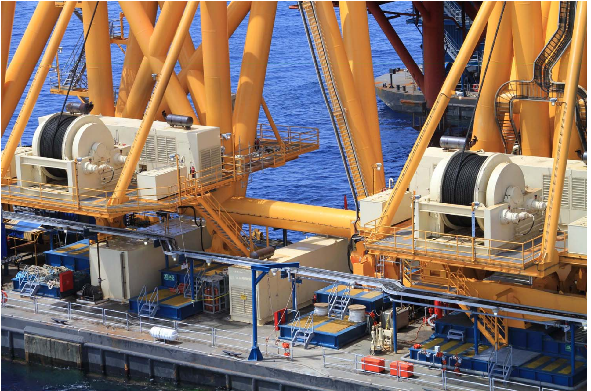
The system's four 300-ton main hoist winches, each carrying 7500 feet of 3 1/2 " wire rope, are idled up and ready to go. The VB - 10000 has a lift capacity of 7,500 tons.