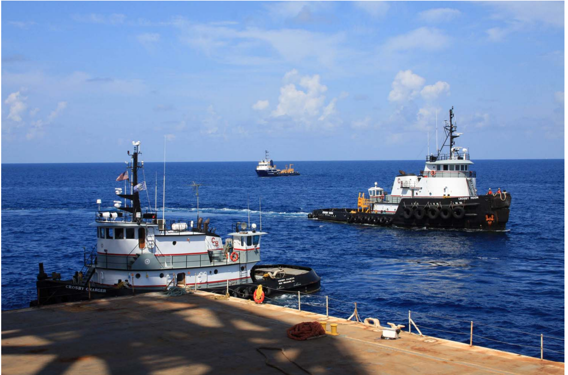
3:30 PM. The welders have been removed from the barge, and the tugs position themselves for the sail-away.