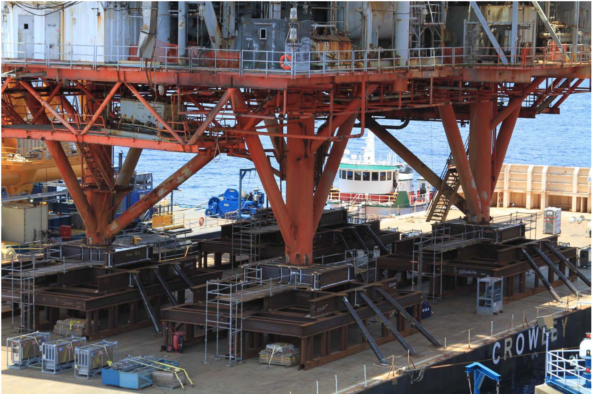
12:50 PM. The VB – 10000 lowers the topside onto the stabbing cones, and releases most of the load.