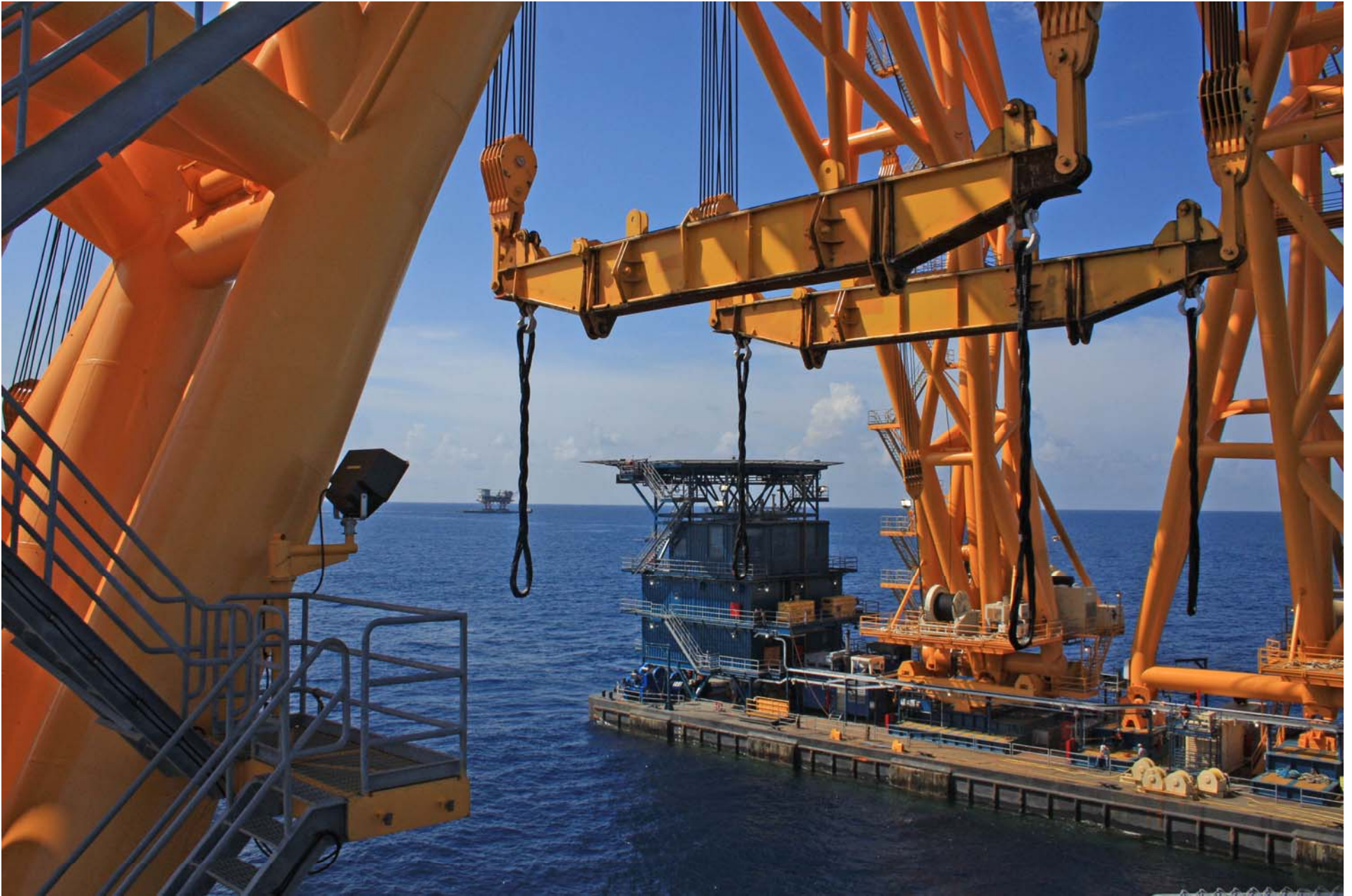
An excellent view of the rigging. The topside can be seen under tow on the horizon.