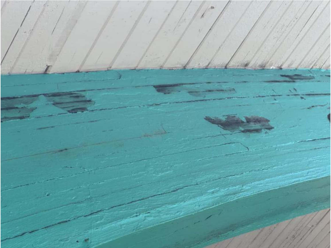
Arch #1 at South Side of Bldg (Viewing West portion of Arch at west wall) NOTE: Delamination