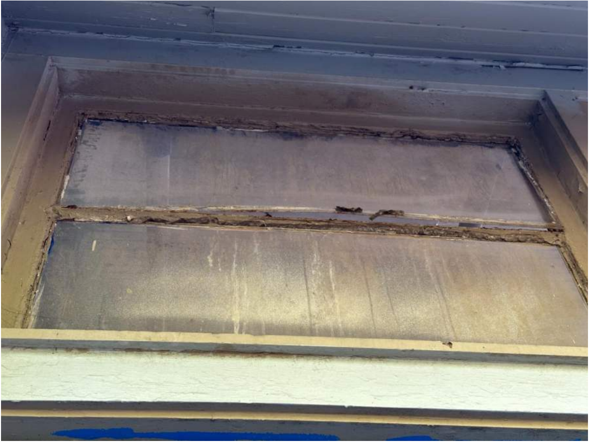
Typical Window Condition (Note obvious damage and poor condition of framing and glazing)