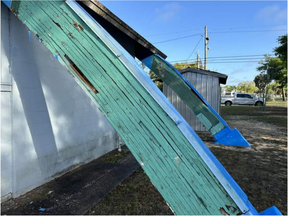
Arch #6 in Photo Foreground; East End of Arch near NE corner of Bldg