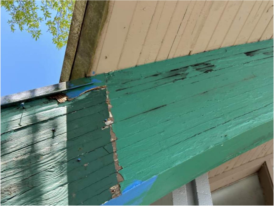
Arch #1 at South Side of Bldg (Viewing West End of Arch at west wall) NOTE: Severe Decay & Delamination