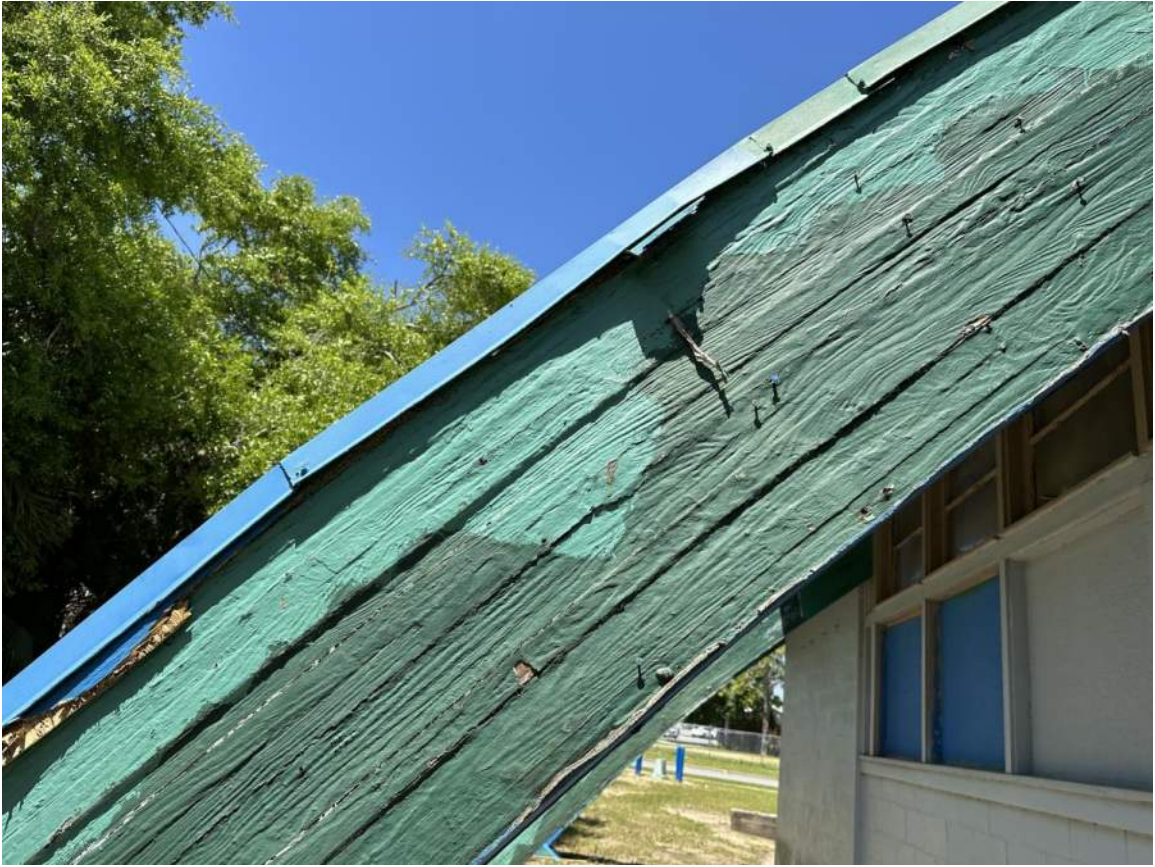
Arch #2; West End near SW corner of Bldg (Viewing West portion of Arch just above Concrete Buttress) NOTE: Severe delamination & decay