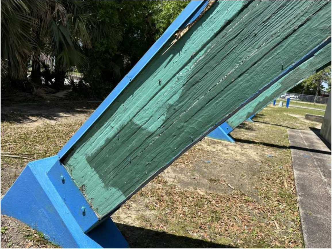
Arch #2; West End near SW corner of Bldg (Viewing West portion of Arch at Concrete Buttress) NOTE: Severe delamination & decay