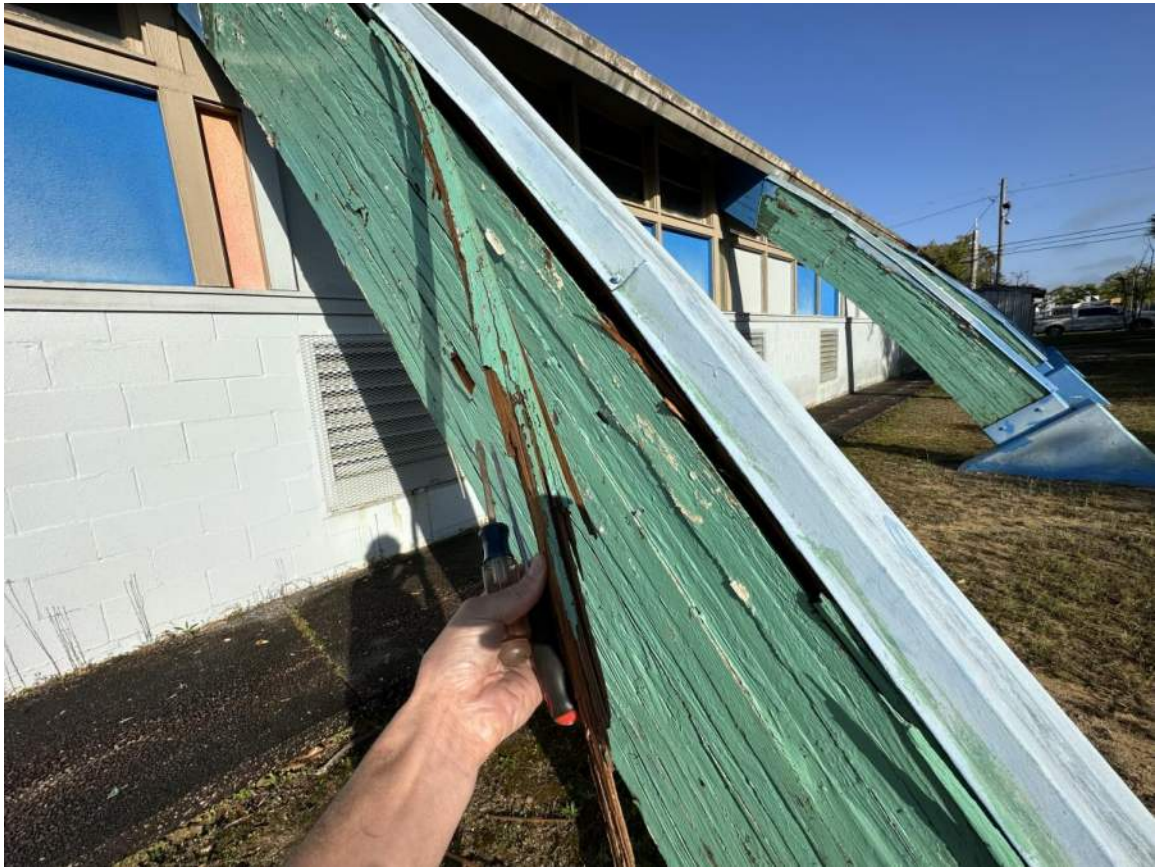
Arch #3 in Photo Foreground; East End of Arch