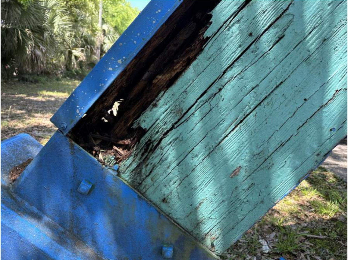
Arch #1 at South Side of Bldg (Viewing West End of Arch at Concrete Buttress) NOTE: Excessive / Severe Decay