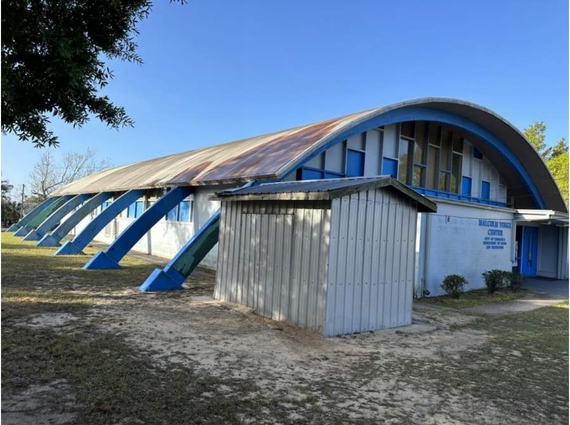
North Side of Building (Looking SW)

NOTE: Arch #7 is on north side and #1 is in the rear of the photo