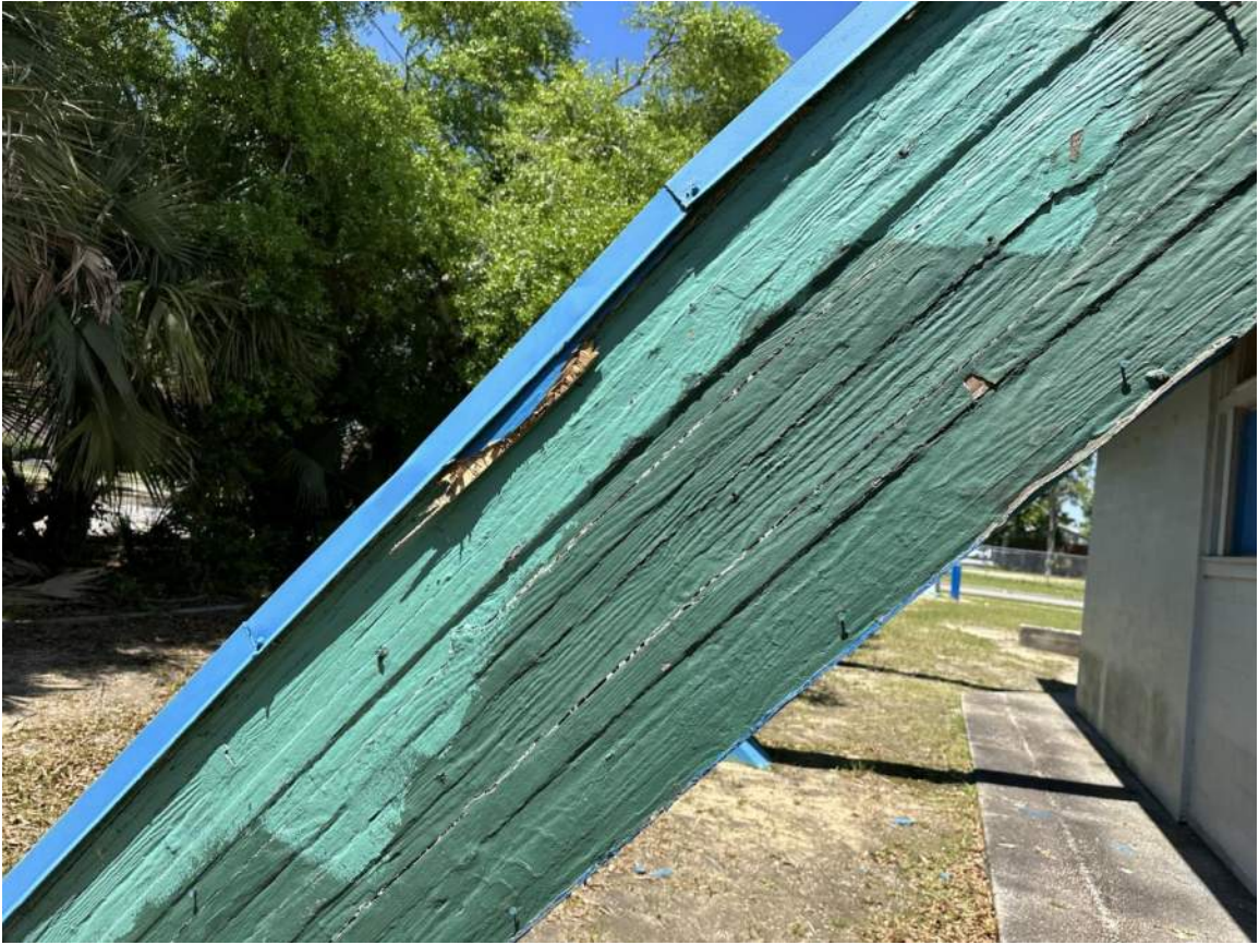
Arch #2; West End near SW corner of Bldg (Viewing West portion of Arch just above Concrete Buttress) NOTE: Severe delamination & decay