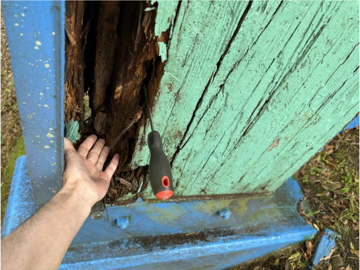
Arch #1 at South Side of Bldg (Viewing West End of Arch at Concrete Buttress) NOTE: Excessive / Severe Decay