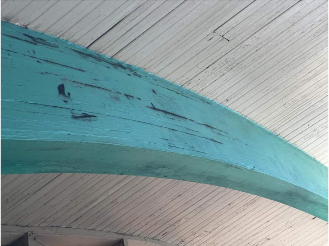
Arch #1 at South Side of Bldg (Viewing West portion of Arch between west wall at top of Arch) NOTE: Delamination