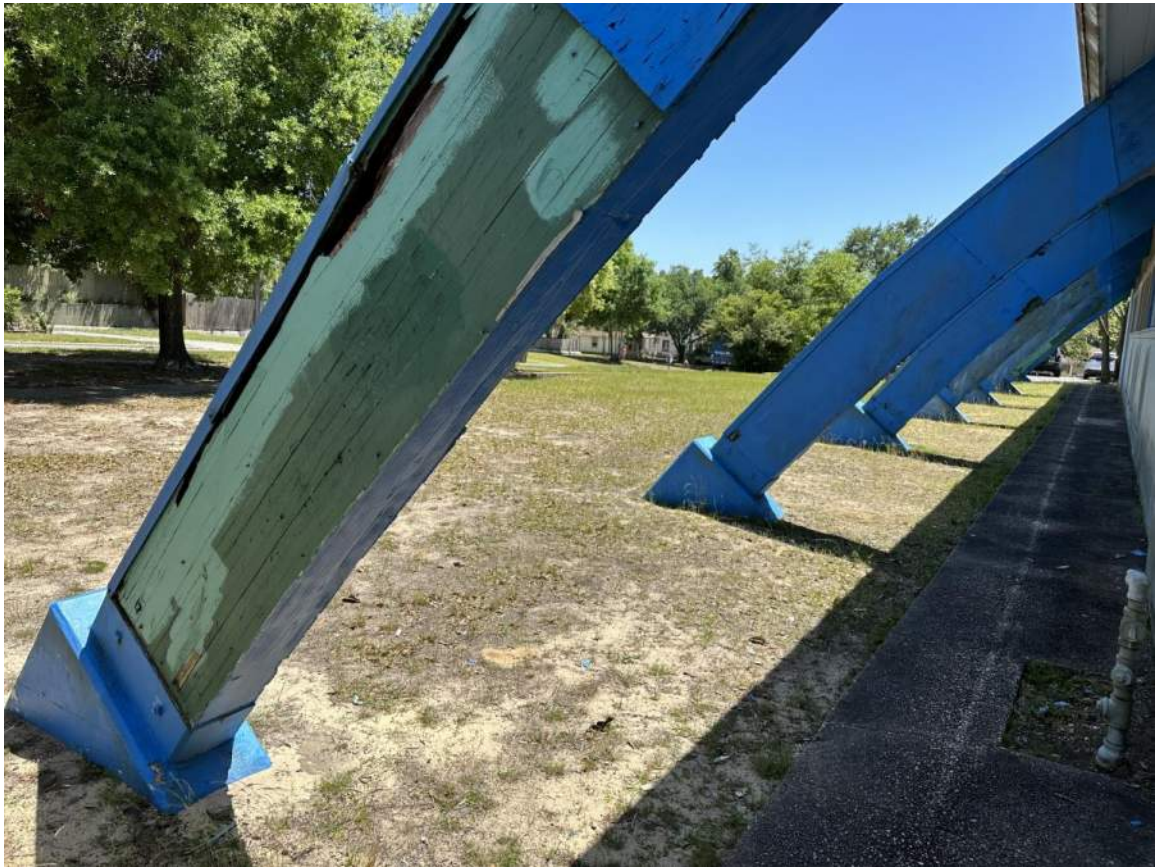
Arch #7 in Photo Foreground; East End of Arch near NE corner of Bldg