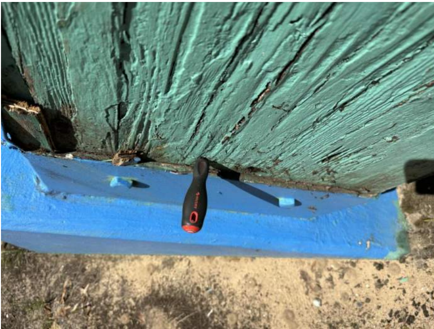
Arch #6; West End of Arch near NW corner of Bldg (Viewing West portion of Arch bearing on Concrete Buttress)

NOTE: Severe delamination & decay with screwdriver easily penetrating member