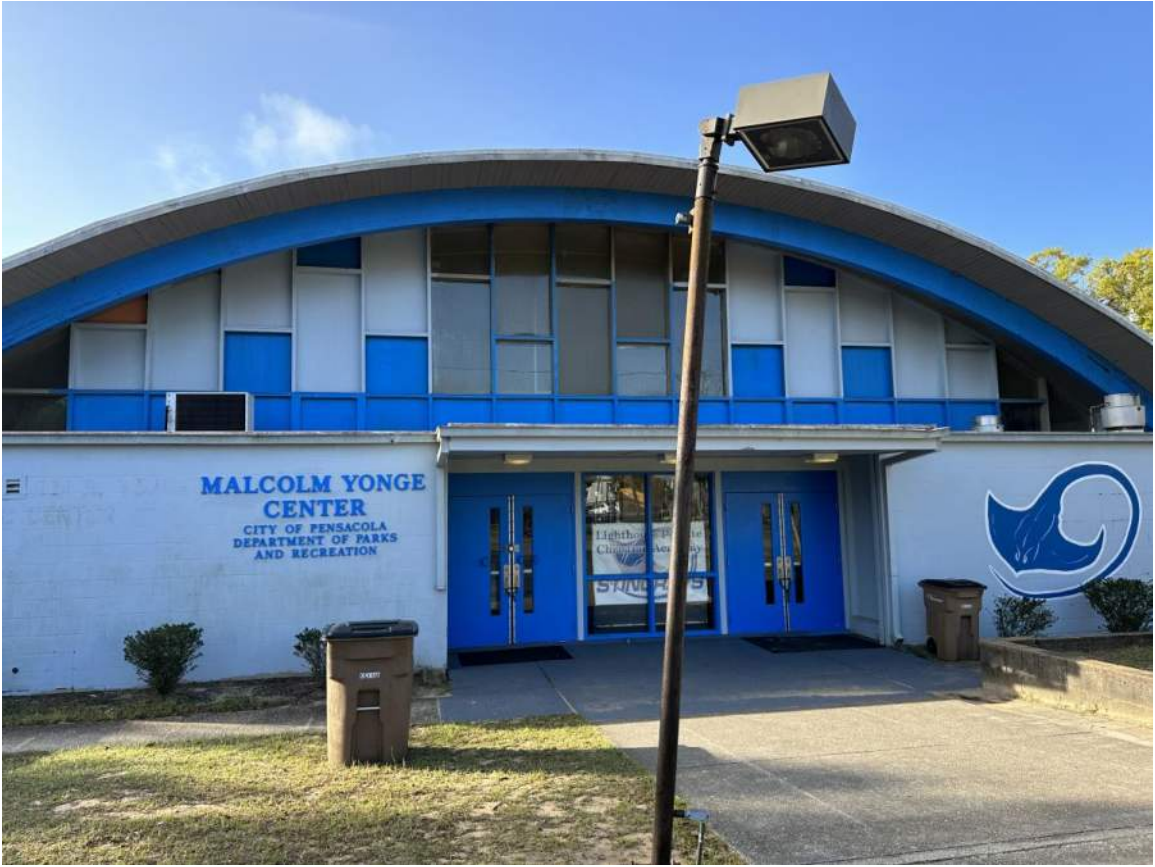
North Side of Building (Looking South)