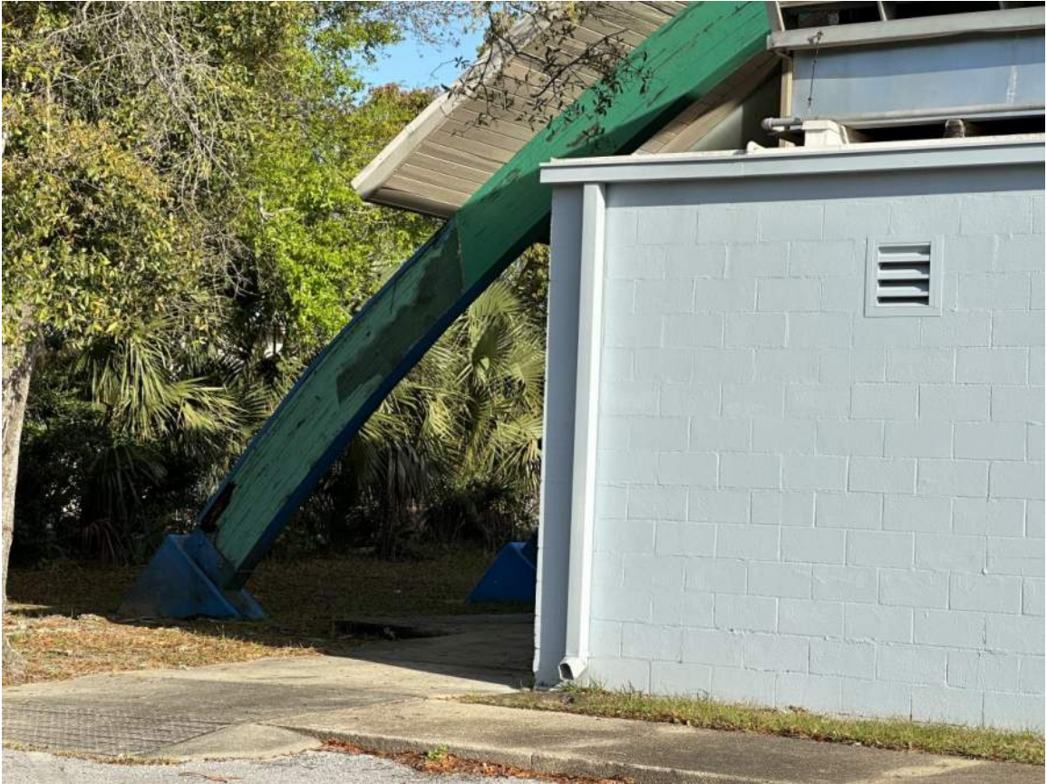
Arch #1 at South Side of Bldg (Viewing West End of Arch)