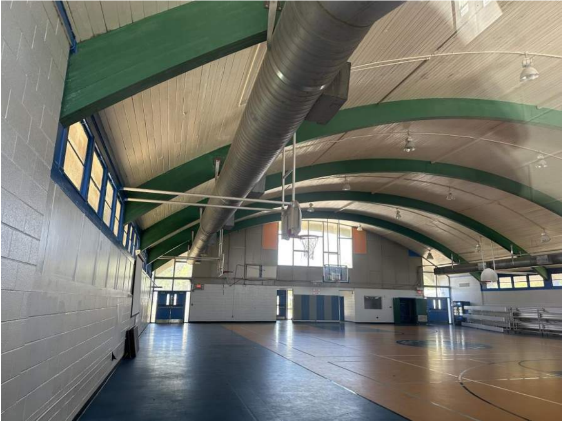
Inside of Bldg (Looking South towards south wall)