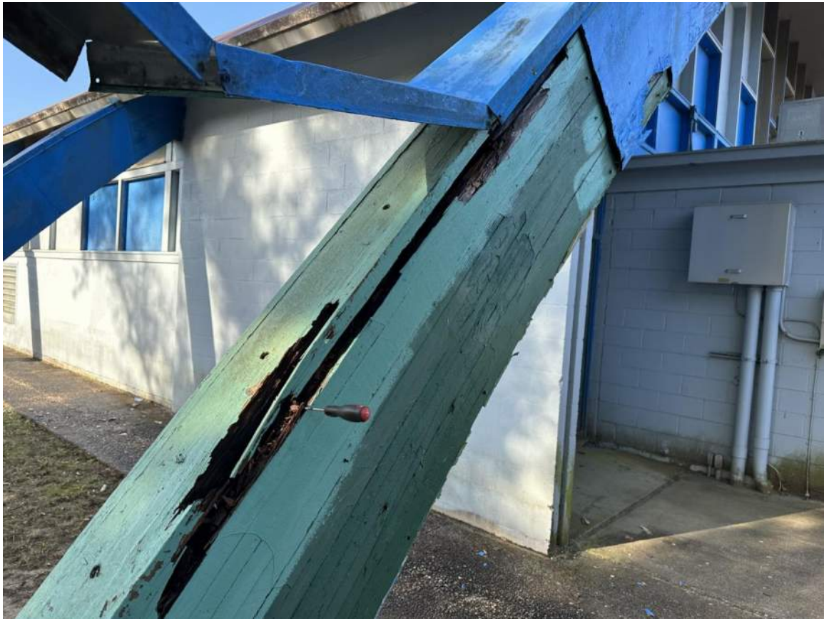
Arch #7 in Photo Foreground; East End of Arch near NE corner of Bldg NOTE: Severe delamination & decay