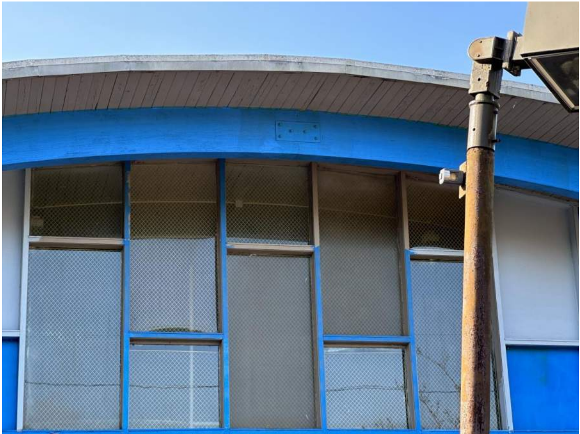
Top of Arch #7 at North Side of Building (Looking South)