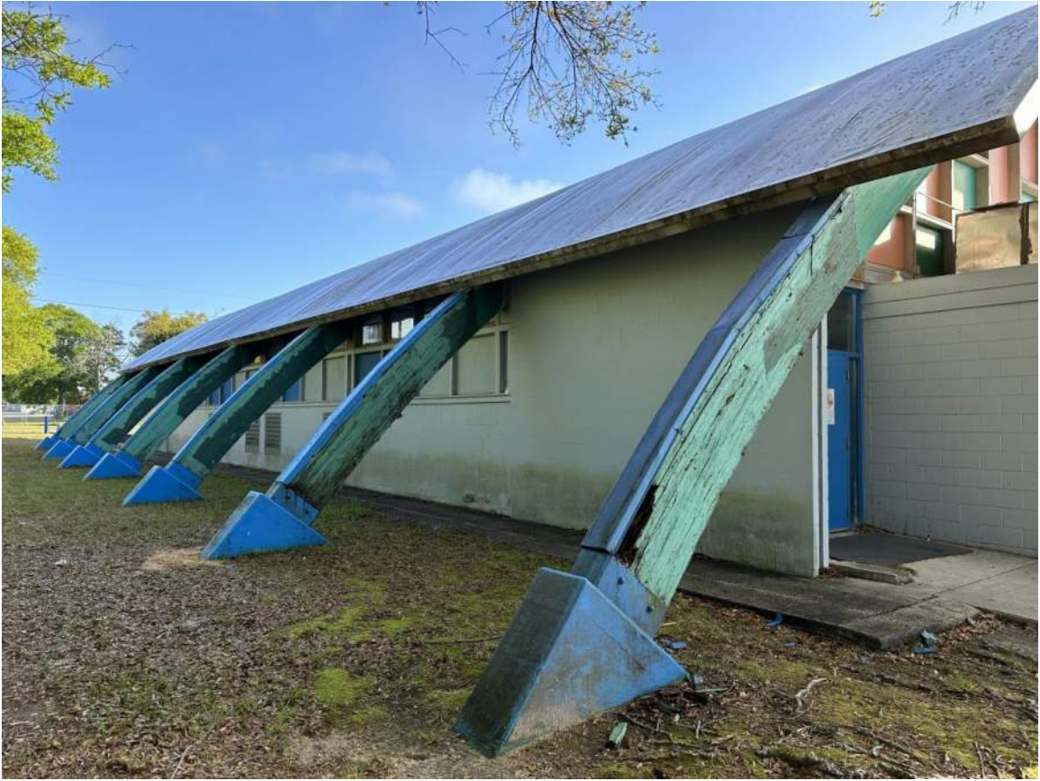
Arch #1 in foreground of photo at South Side of Bldg (Viewing West End of Arches; Looking NE)