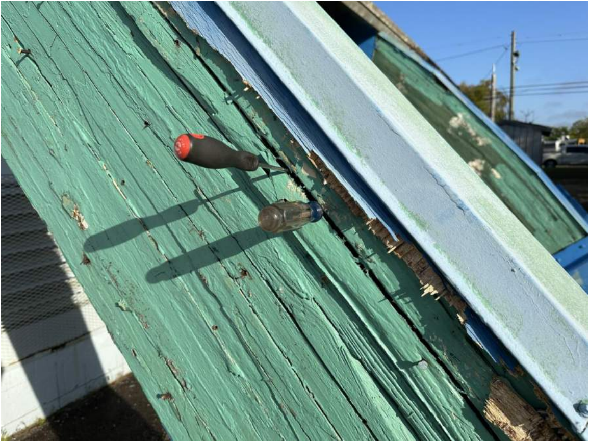
Arch #4 in Photo Foreground; East End of Arch NOTE: Severe delamination & decay