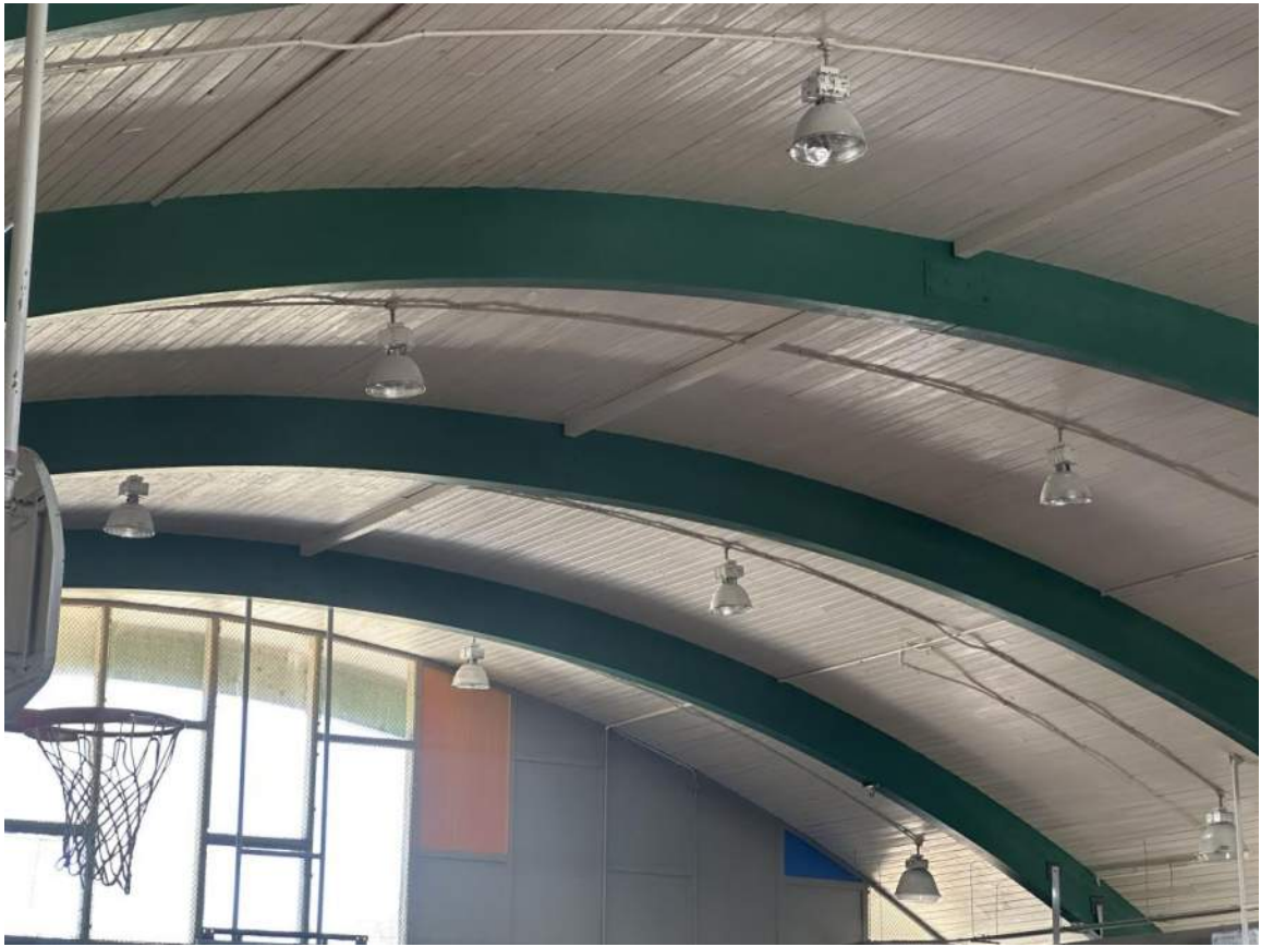
Inside of Bldg – Top of Arches (Looking South)