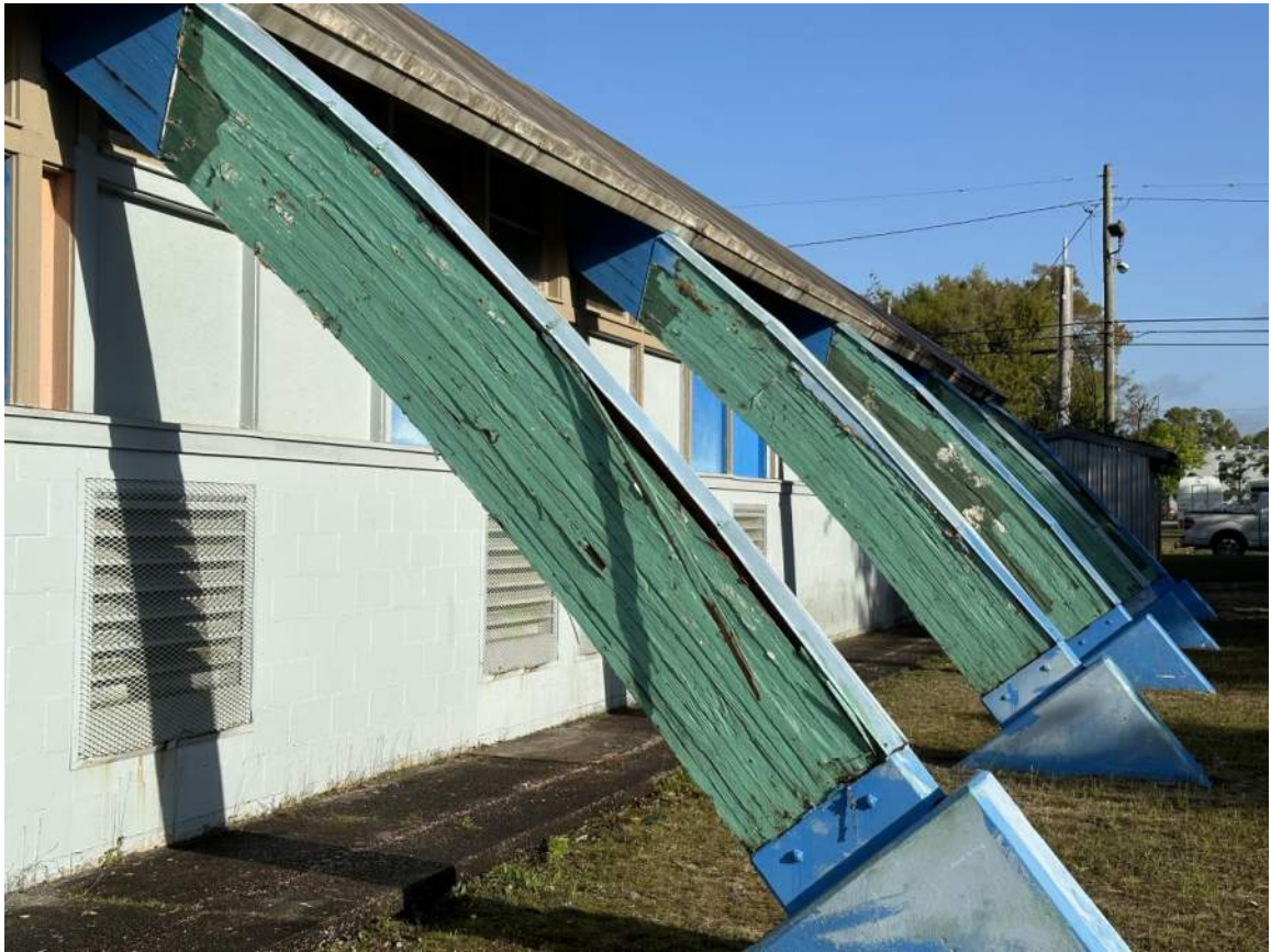
Arch #3 in Photo Foreground; East End of Arch