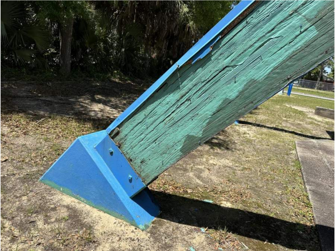
Arch #6; West End of Arch near NW corner of Bldg (Viewing West portion of Arch just above Concrete Buttress)