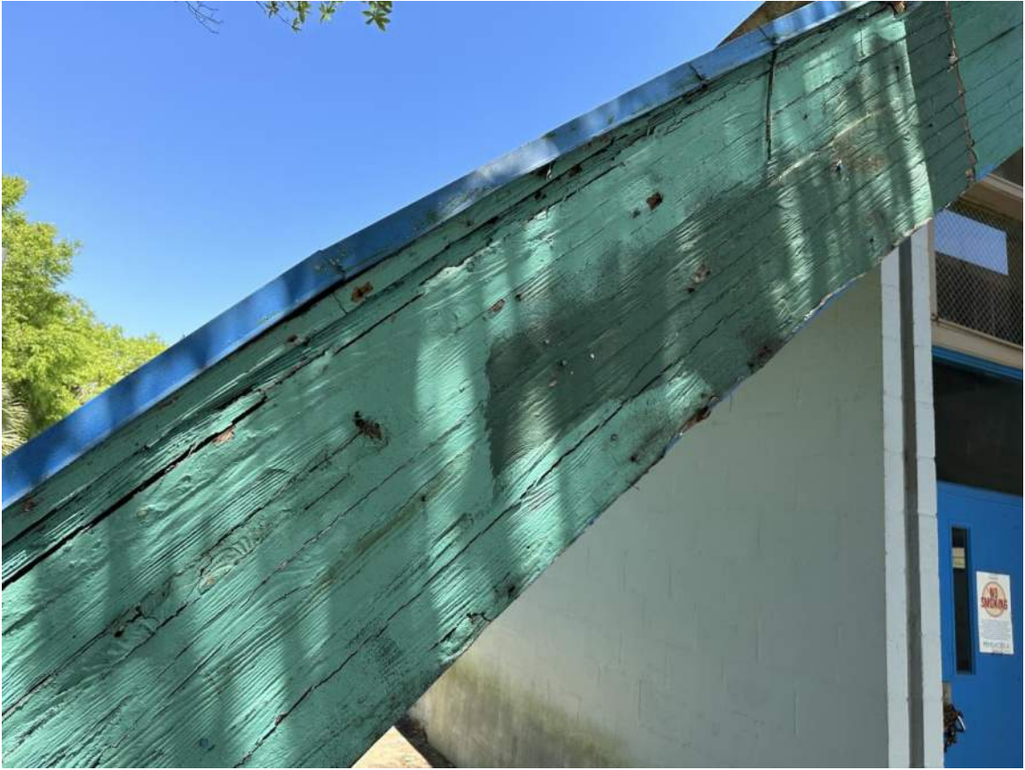
Arch #1 at South Side of Bldg (Viewing West End of Arch between Concrete Buttress and west wall) NOTE: Excessive / Severe Decay & Delamination