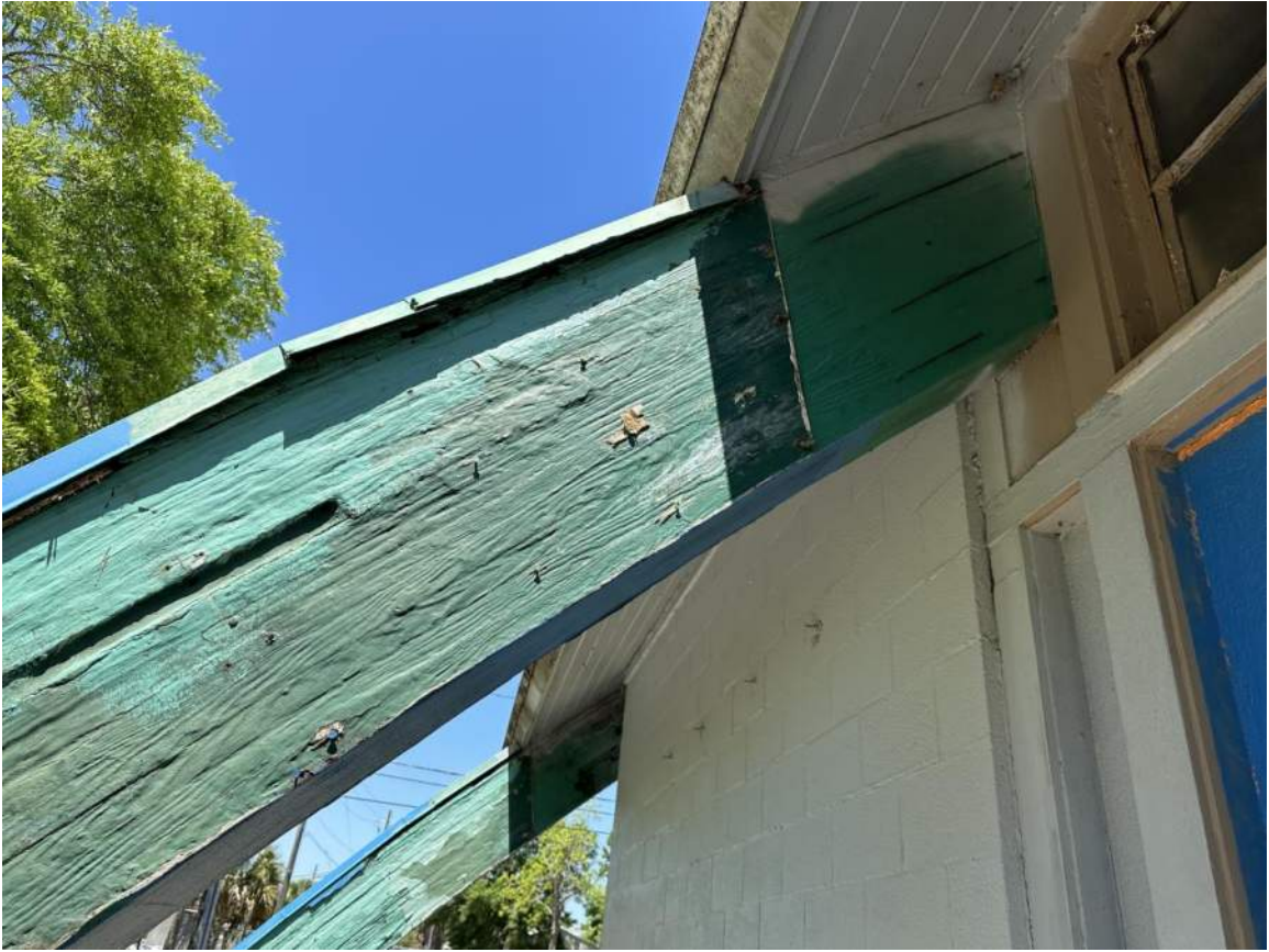
Arch #6; West End of Arch near NW corner of Bldg (Viewing West portion of Arch just above Concrete Buttress and Near West Wall) NOTE: Severe delamination & decay