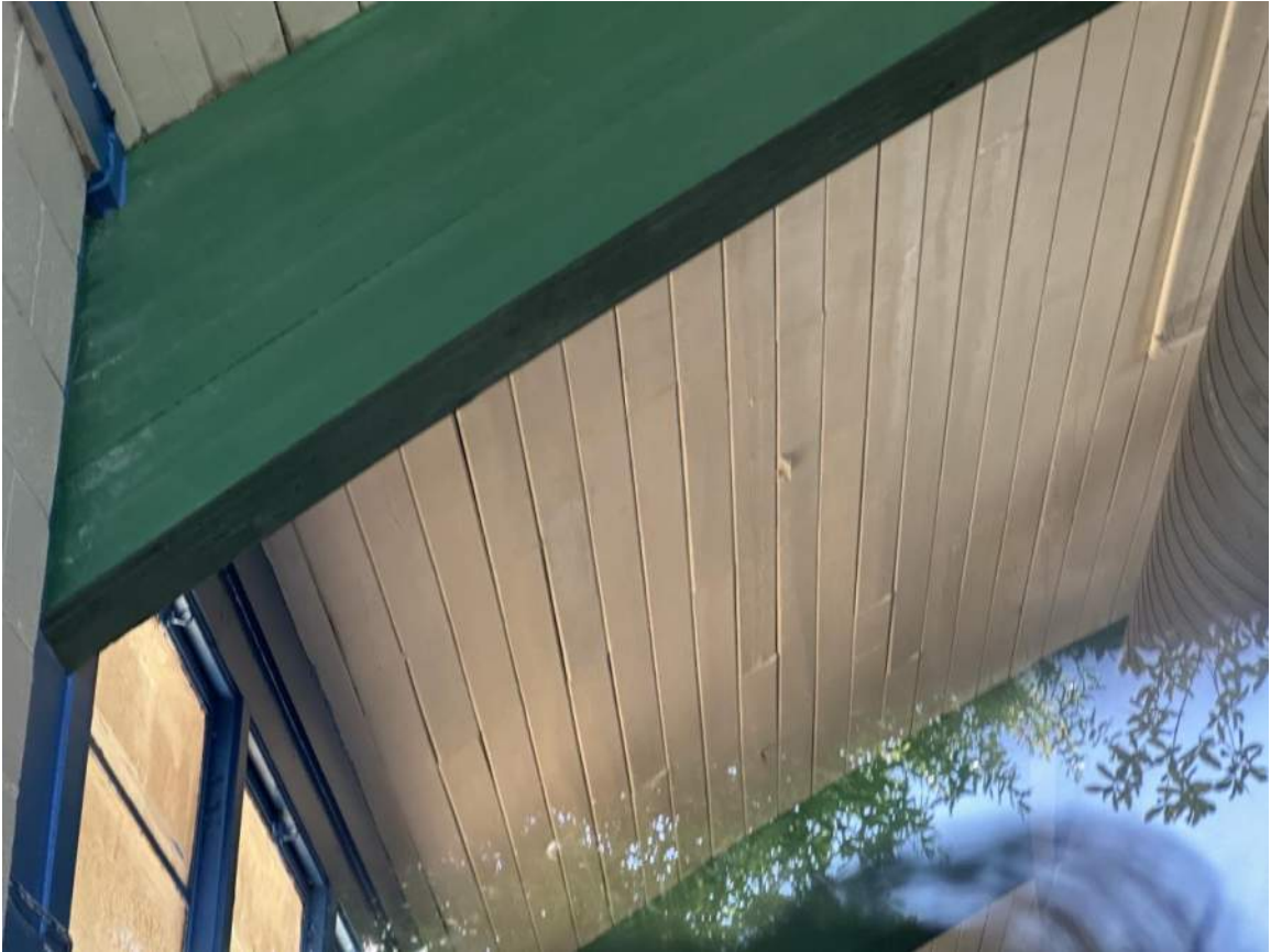
Inside of Bldg – Arch #3 Passing Through East Wall

NOTE: Notice delamination near bottom of Arch