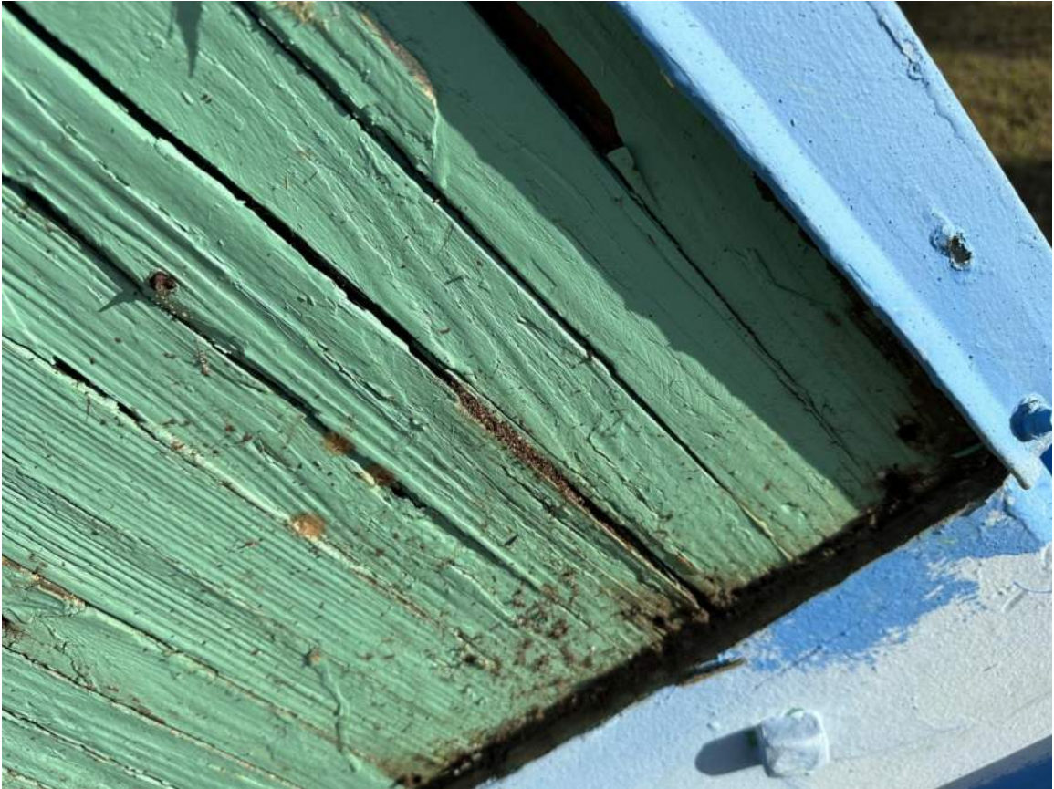
Arch #4 in Photo Foreground; East End of Arch