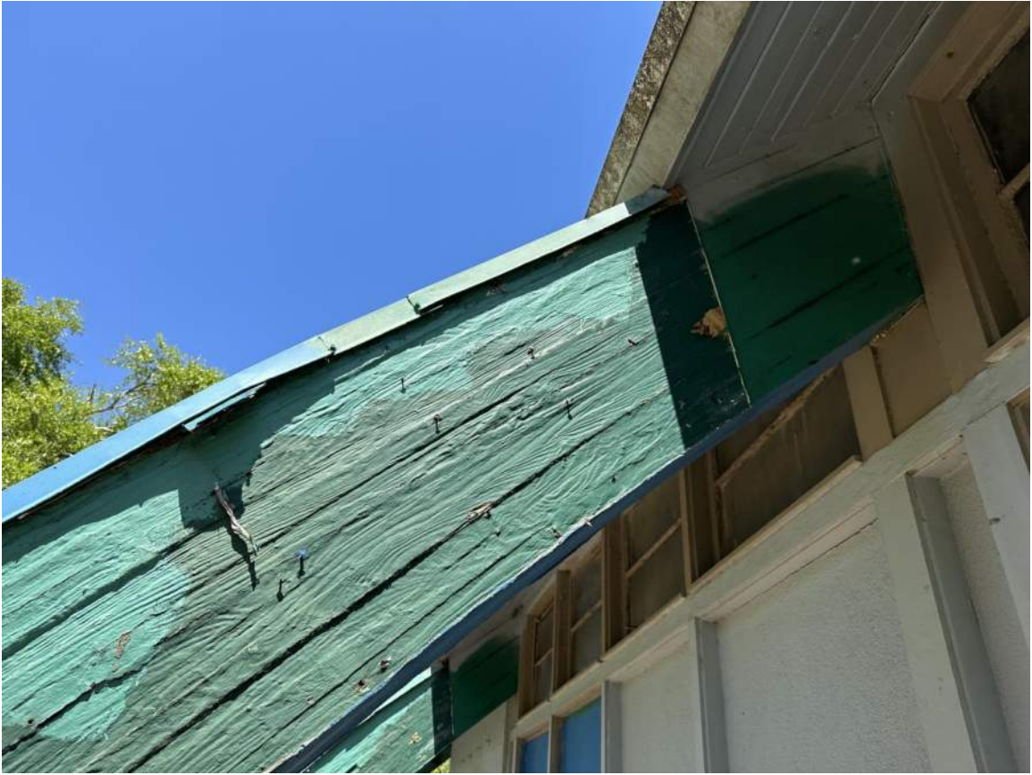
Arch #2; West End near SW corner of Bldg (Viewing West portion of Arch near west wall of building) NOTE: Severe delamination & decay