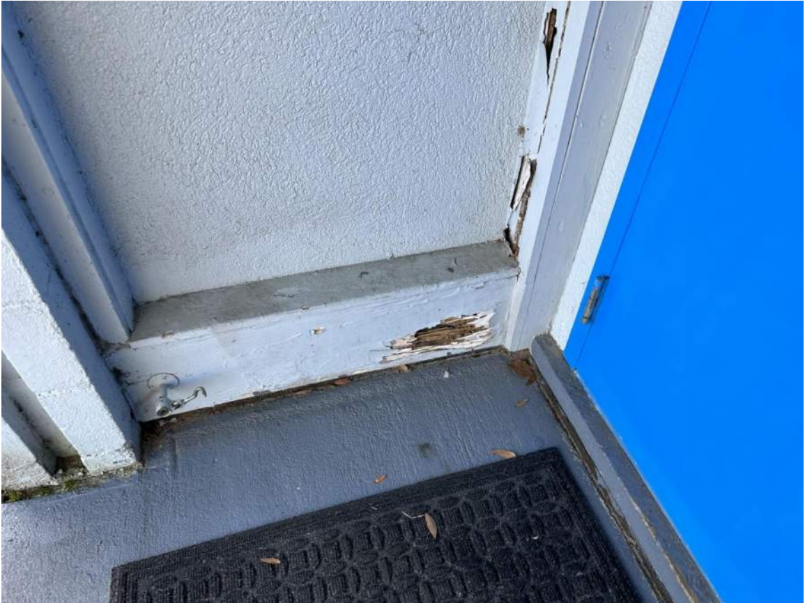
Termite Damage at North Lobby Entrance