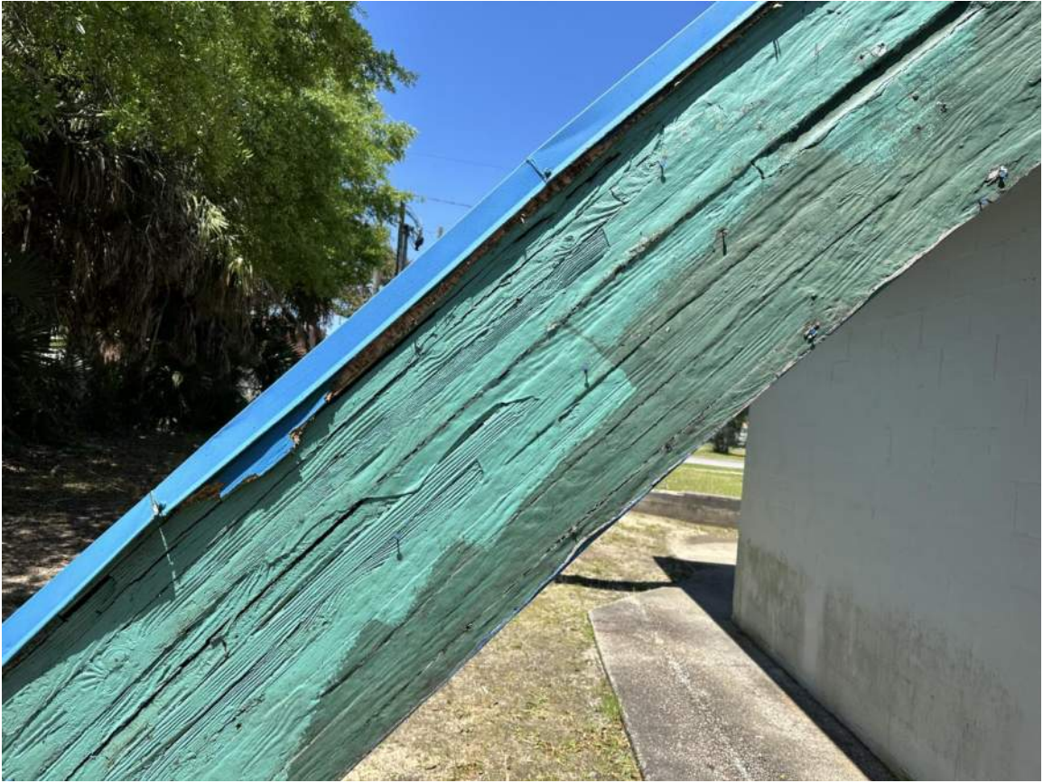
Arch #6; West End of Arch near NW corner of Bldg (Viewing West portion of Arch just above Concrete Buttress)