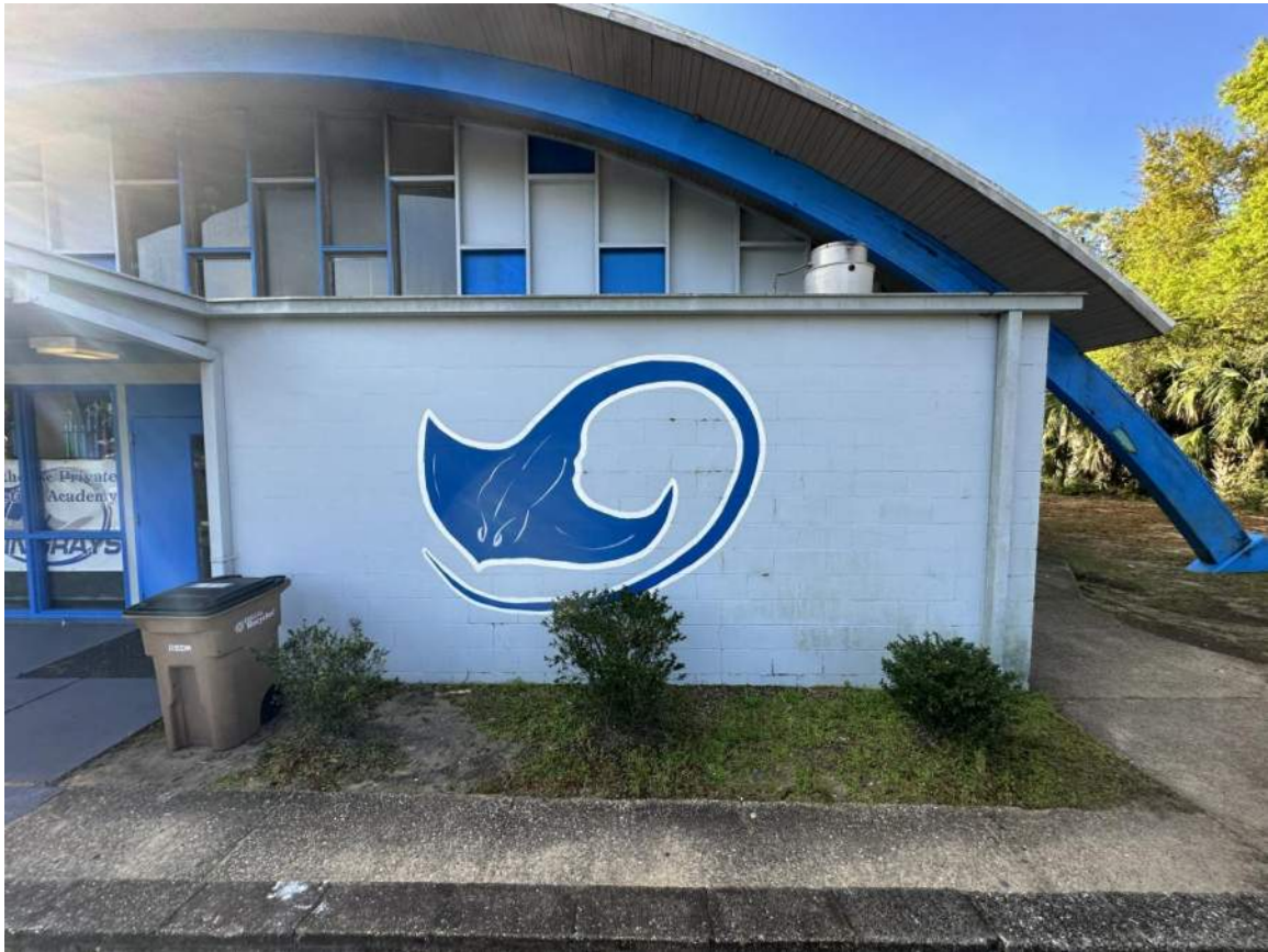
Arch #7 & Cracked CMU Wall at North Side of Bldg (Looking South)