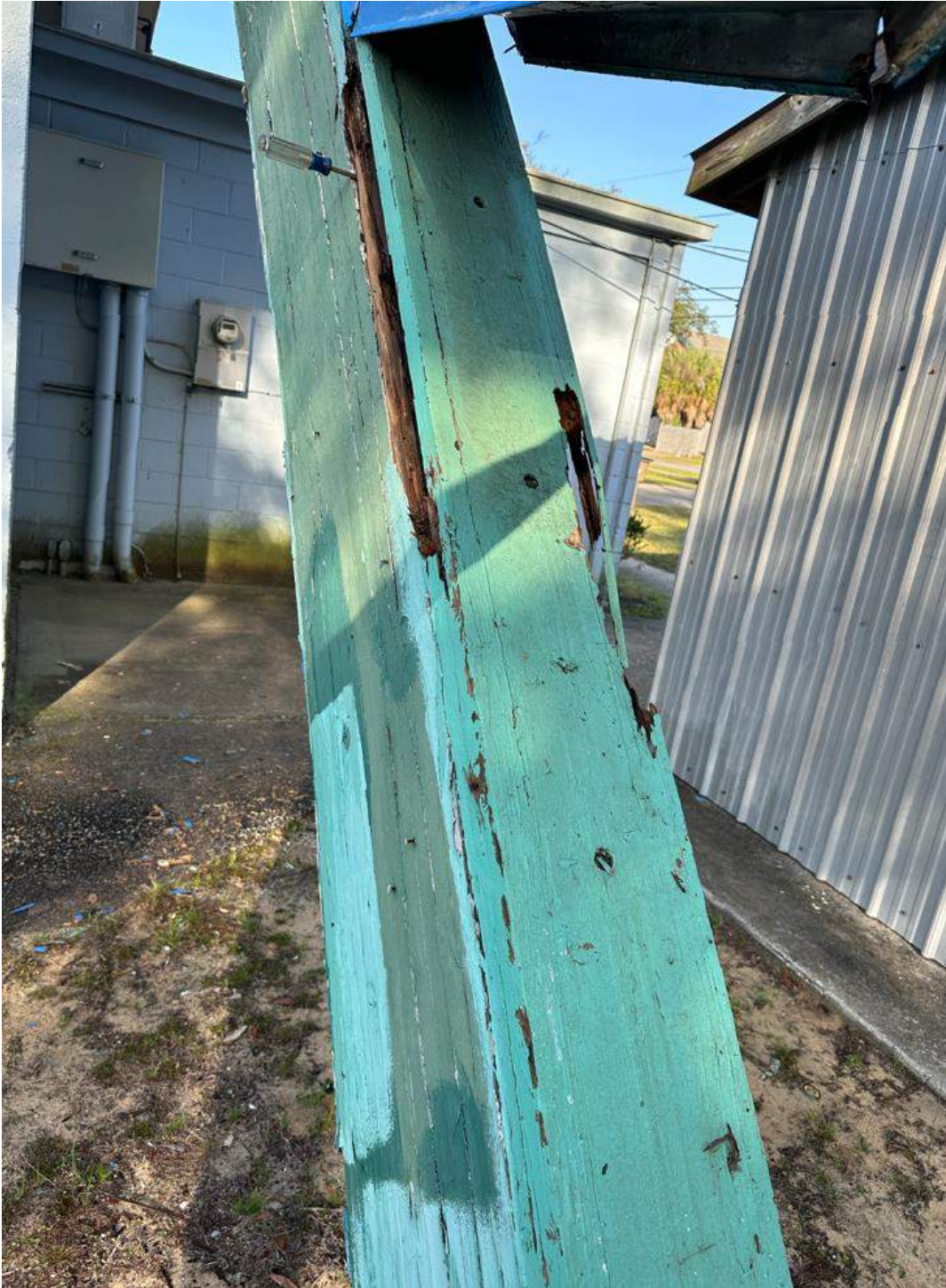
Arch #7; East End of Arch near NE corner of Bldg