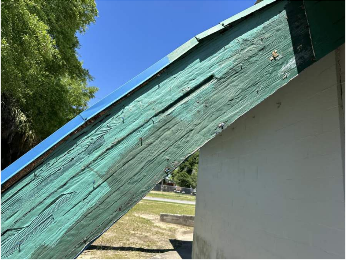
Arch #6; West End of Arch near NW corner of Bldg (Viewing West portion of Arch just above Concrete Buttress and Near West Wall) NOTE: Severe delamination & decay