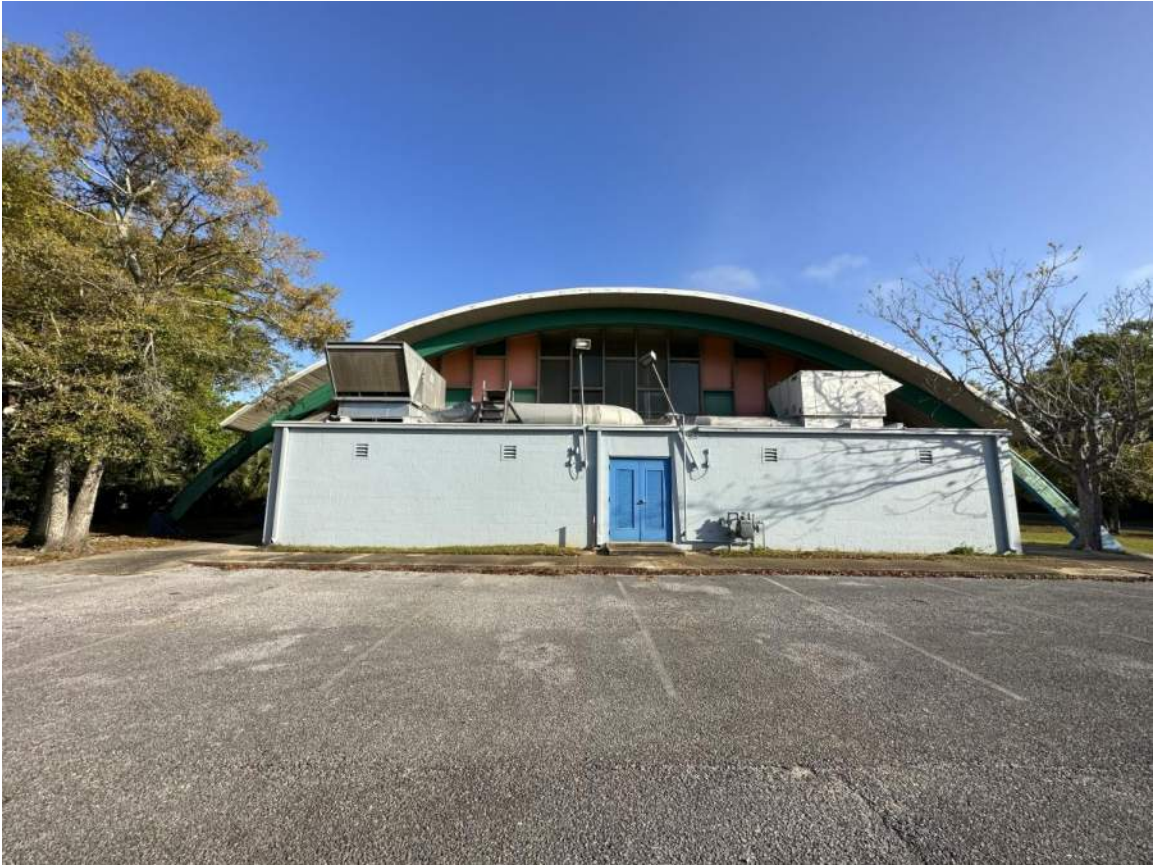
South Side of Bldg (Looking North)