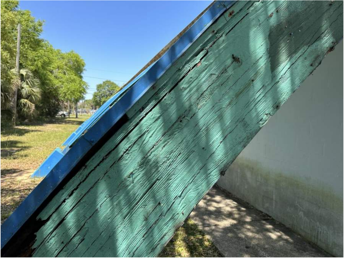
Arch #1 at South Side of Bldg (Viewing West End of Arch at Concrete Buttress) NOTE: Excessive / Severe Decay