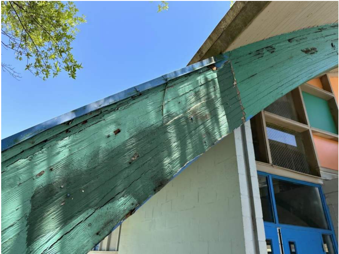
Arch #1 at South Side of Bldg (Viewing West End of Arch between Concrete Buttress and west wall) NOTE: Excessive / Severe Decay & Delamination