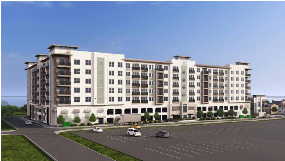
2. North Perspective